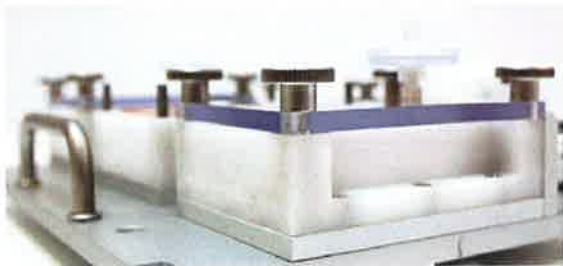
Figure 2. TC-3 chambers

The TC-3 is computer operated by a simple control software that allows the user to create complex loading profiles to be applied on the culture samples.