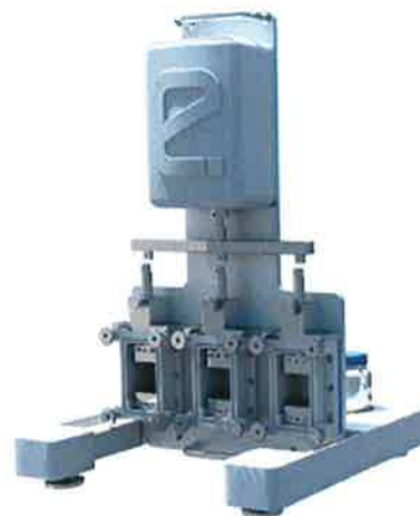
Figure 1. TC-3 bioreactor

The most prevalent approach to cartilage tissue engineering involves the combination of chondrocytes (or mesenchymal progenitor cells) with scaffolds (fibrous meshes or hydrogels) for long-term culture. The adoption of a suitable culture system for chondrocytes is critical, since, for example, chondrocytes have been shown to lose their phenotype in monolayer culture after being passaged. Nevertheless, chondrocytes are able to proliferate in three-dimensional culture system without phenotype loss.